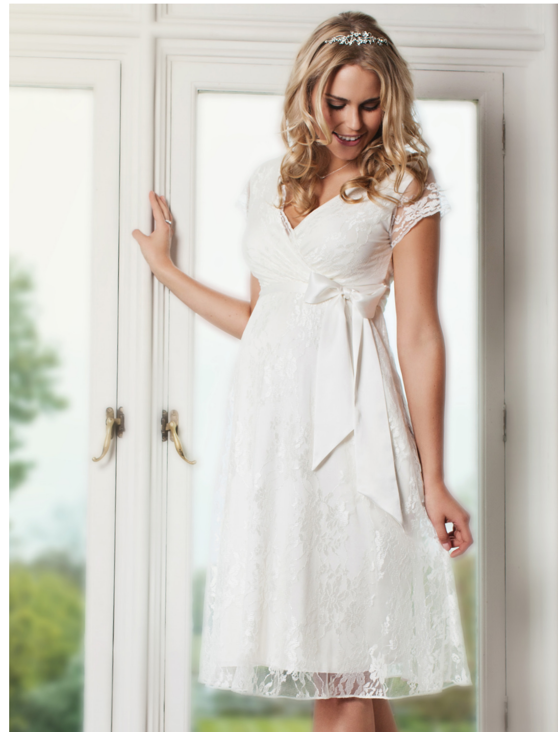
EDEN DRESS £189 IVORY