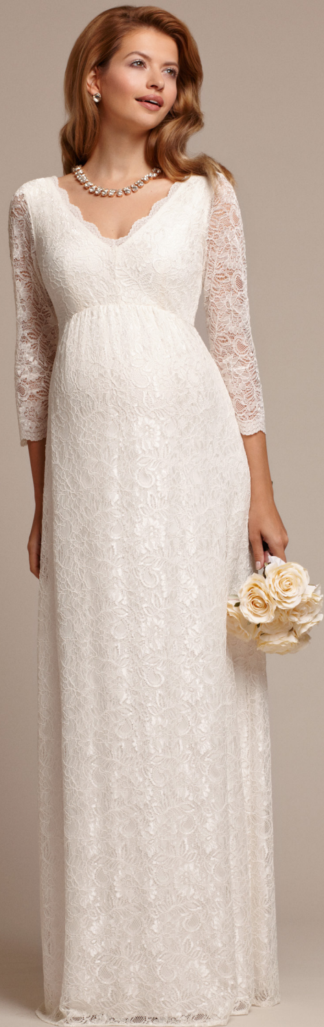
CHLOE GOWN £199 IVORY