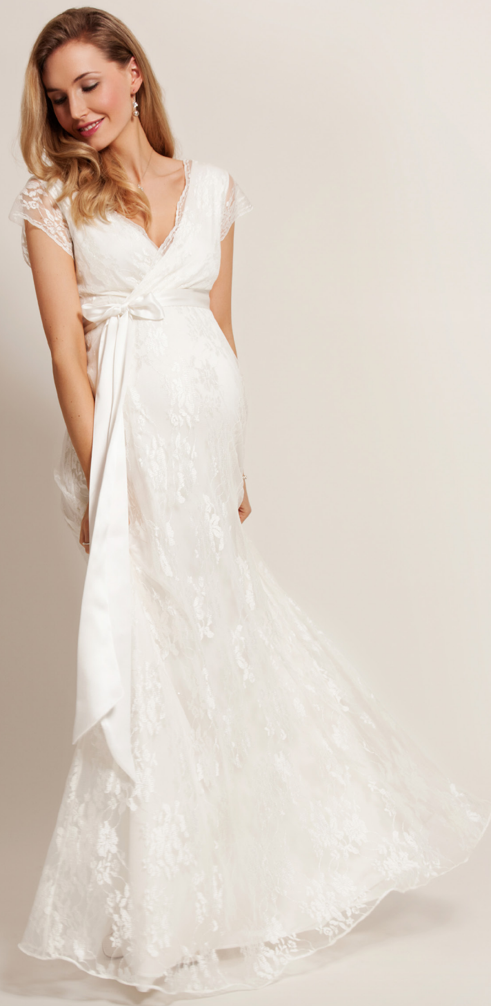
EDEN GOWN £269 IVORY