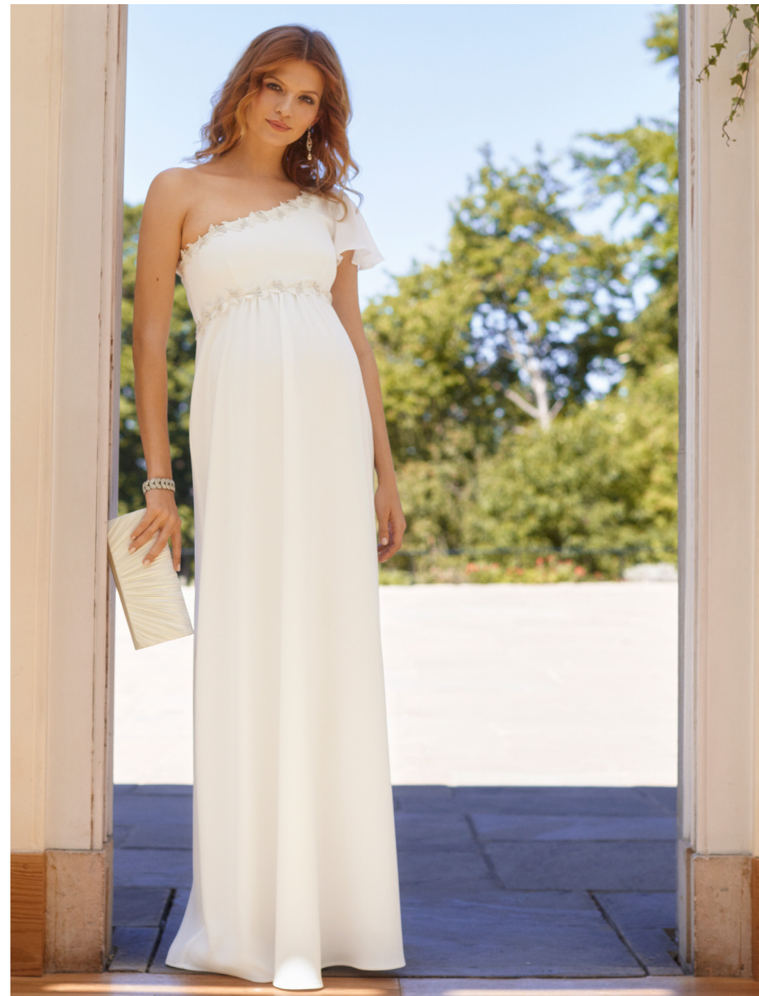
LISBETH GOWN £599 IVORY