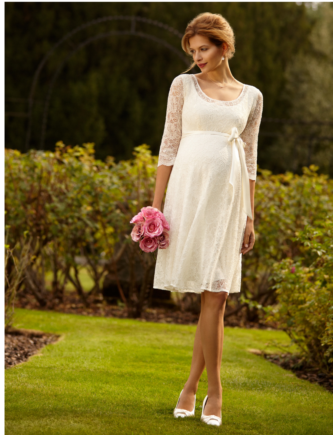
FREYA DRESS £169 IVORY