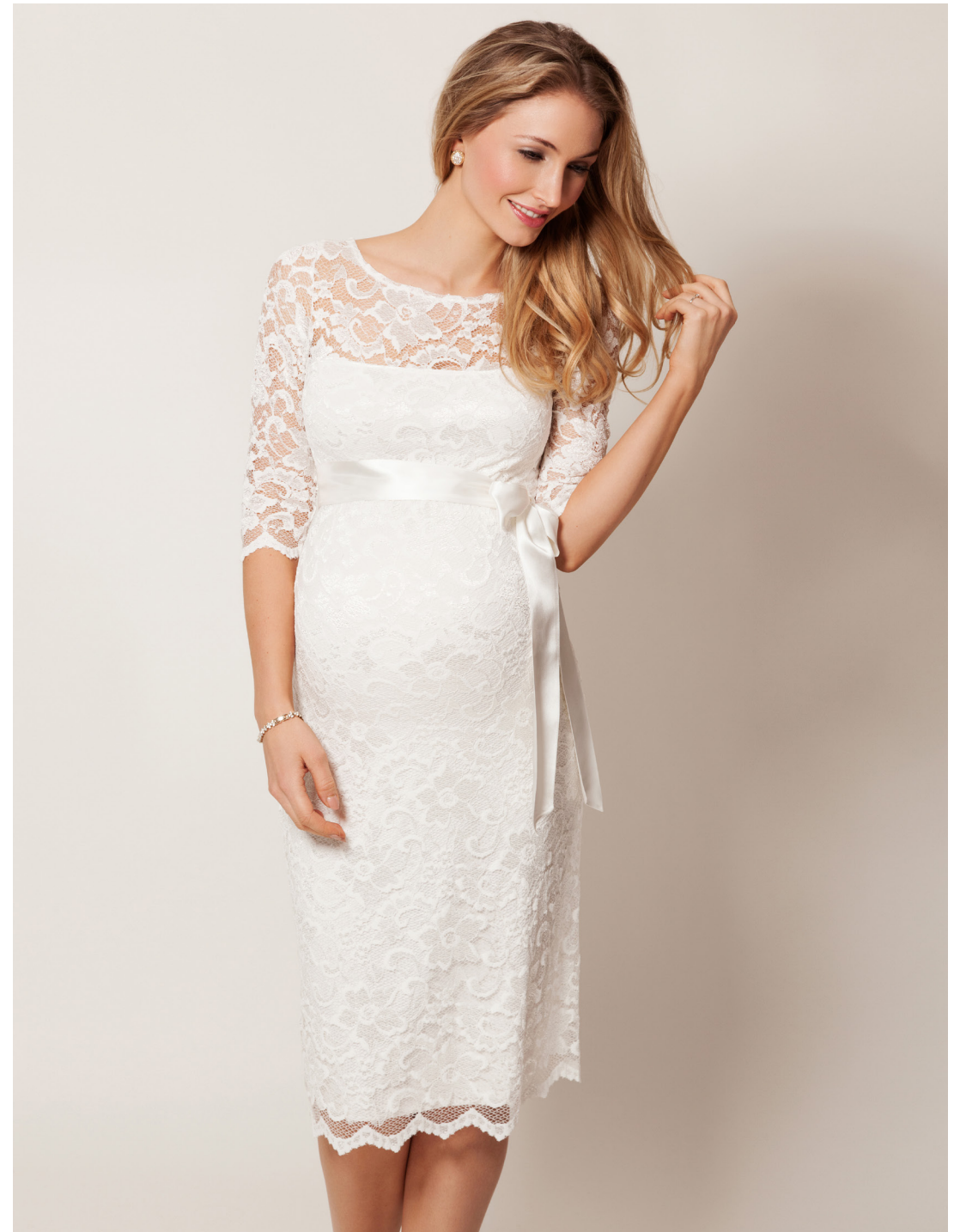
AMELIA DRESS £169 IVORY