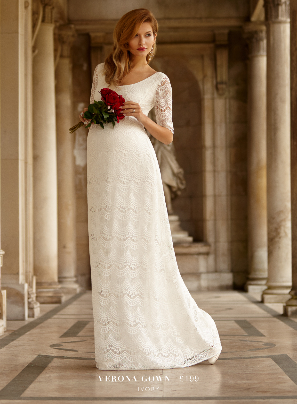
VERONA GOWN £199 IVORY