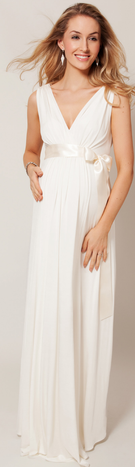
ANASTASIA GOWN £225 IVORY