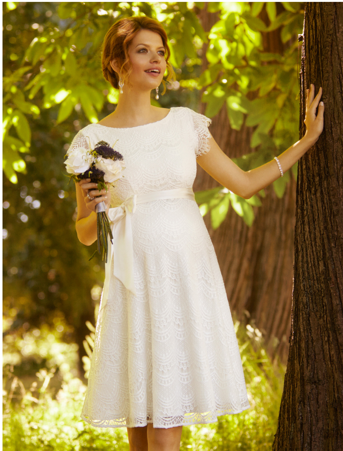
HARRIET DRESS £169 IVORY