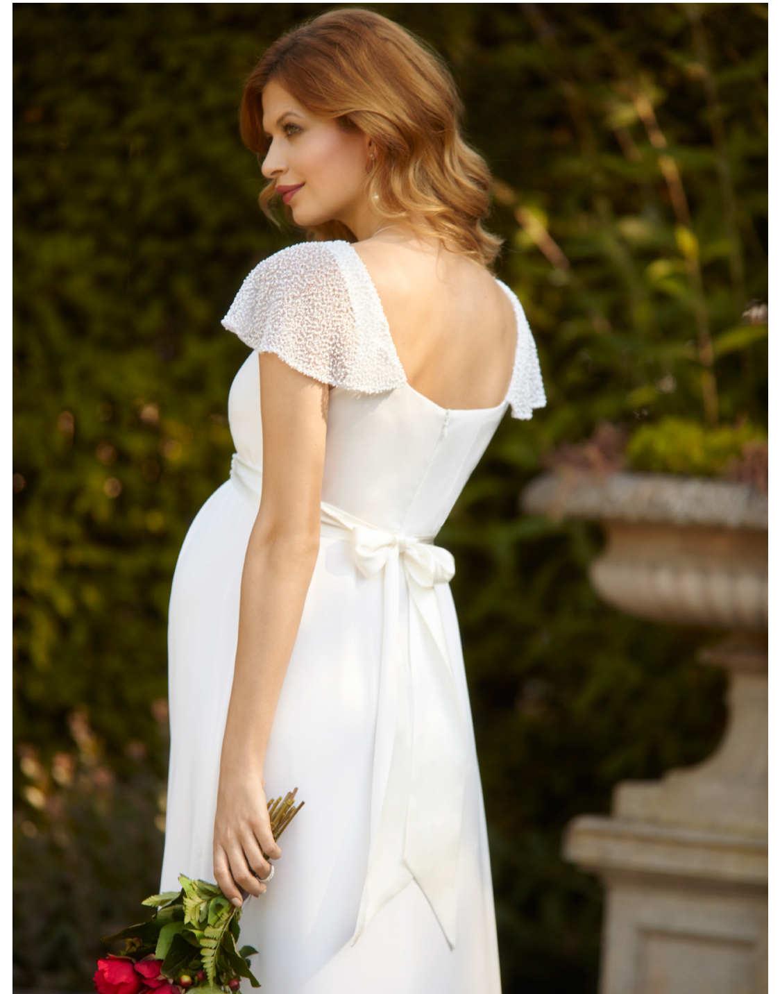
LORELEI GOWN £599 IVORY