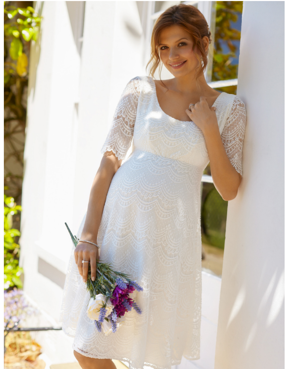
VERONA DRESS £169 IVORY