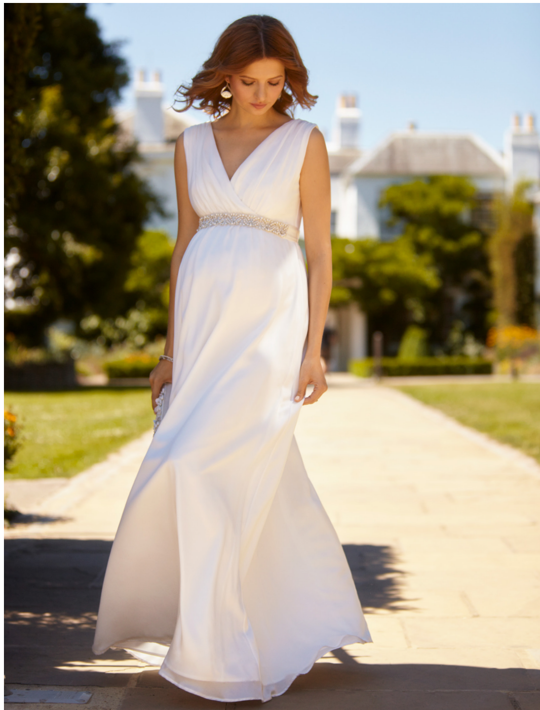
AVA GOWN £599 IVORY