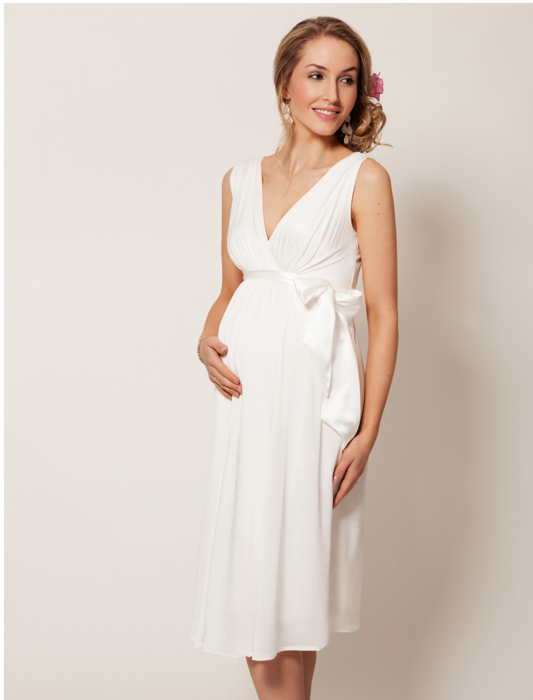
ANASTASIA DRESS £169 IVORY