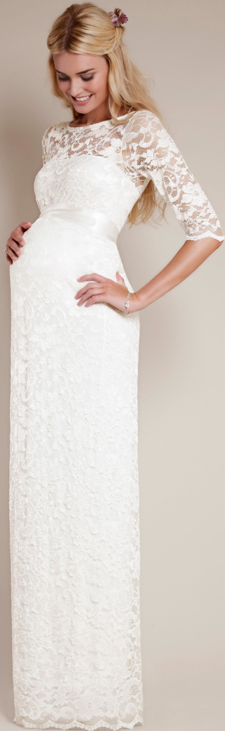
AMELIA GOWN £249 IVORY